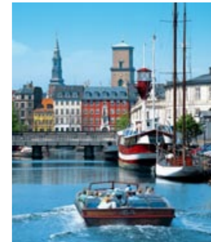
A peaceful and relaxing boat trip is a nice break from a hectic schedule.