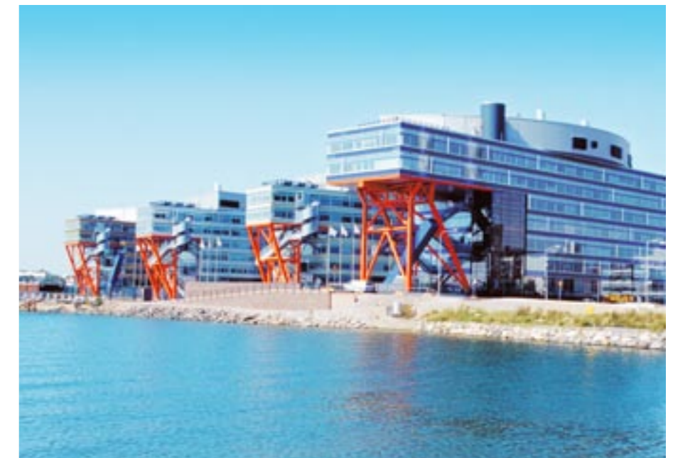
High standards of living, a multi-party political system and high moral and social values are hallmarks of the modern Finnish way of life.

Finnish design is unique and emphasizes natural materials. Stockmann department store in Helsinki is one of the most exclusive stores in Scandinavia. Here you can find most famous brands, such as Iittala glassware and Marimekko, known for fashions, fabrics and gifts. You can also find a real bargain at the Arabia Porcelain Factory and Museum, at Sokos department store and in the shops along Esplanadi Street in Helsinki. Local goods are sold at the marketplace in the harbour.