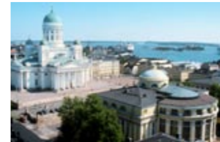
Helsinki is a modern and culturally progressive city.