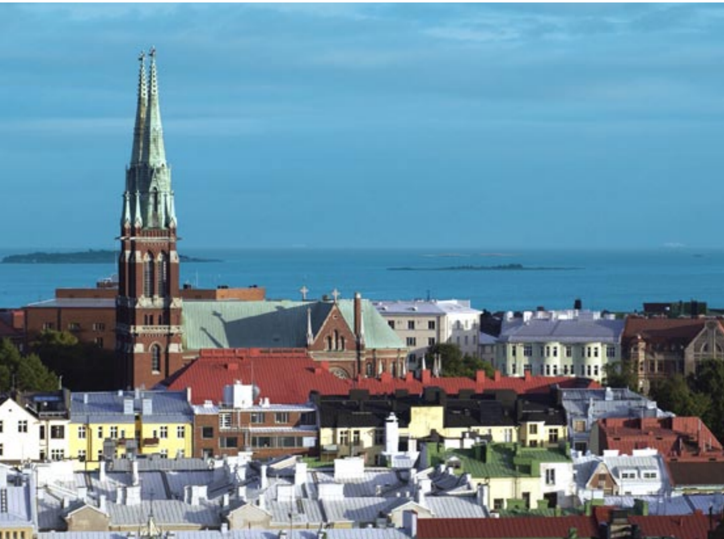
Helsinki is a compact and beautiful city, ideal for seeing on foot.

Rovaniemi in the north offers fun and excitement. Relax in a traditional sauna, go skiing or browse in the numerous gift shops in Santa Claus Village and experience the ceremony connected with crossing the Arctic Circle. It is also possible to visit the reindeers of Santa Claus at a genuine Lapp reindeer farm. The Sami (Lapp) people, with their brightly coloured costumes and old customs, are truly unique.