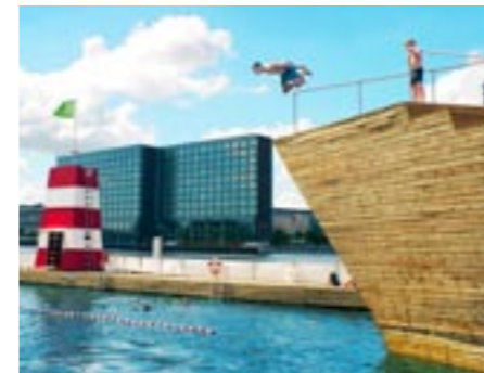
Scandinavian designs bear the characteristics of "simplicity," "functionality," and "sophisticated modern design" that are based on human engineering.

of his tragedy Hamlet. Frederiksborg Castle, built by King Christian IV, is also located in North Sealand. This magnificent Dutch renaissance style castle houses the Danish National Historical Museum, which holds an extensive renaissance collection of fine art, porcelain, silver and furniture. Copenhagen has a rich cultural life and the Copenhagen people recently got a new opera house, designed by the famous architect Henning Larsen. Odense, another exciting city, was the birthplace of fairytale writer Hans Christian Andersen. His home is now a museum, showcasing rare and unique editions of his work, as well as fascinating personal possessions.