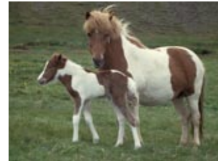
Icelandic horses are small but strong. To go on a horseback excursion is one of the best ways to experience the Icelandic landscape.

A bath in the amazing Blue Lagoon, a unique natural pool of mineral-rich geothermal water in the middle of a lava field, is a must. And why not end the day with a ride on a small, feisty Icelandic horse?