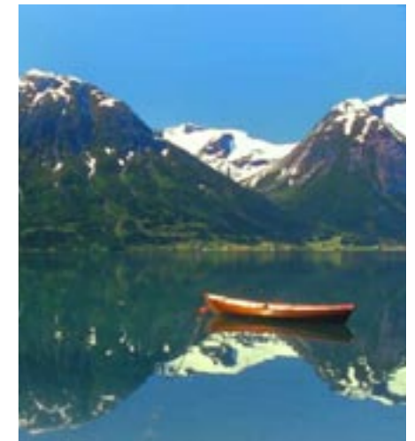
The coastal landscape has mountain plateaus tipping down towards the sea.

The availability of films is good. In addition to commercial movie theatres there are privately owned film clubs, with the films shown in the original language with Norwegian sub-titles.