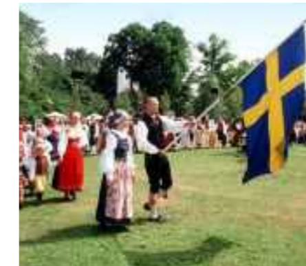
Midsummer is celebrated with folklore music and dancing all over Sweden.

There are casinos with roulette, black jack and other games in the major cities and at large hotels, restaurants and nightclubs.