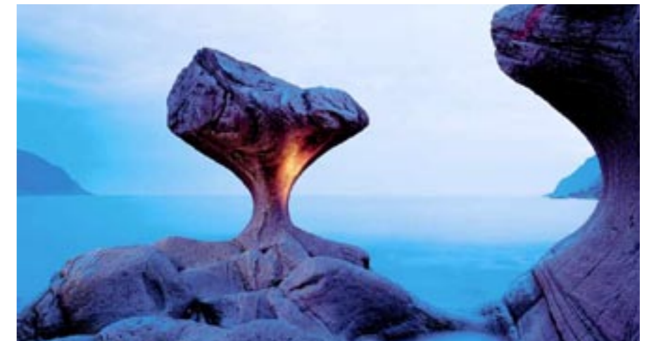
The Fjords were formed during the last Ice Age. The landscape is beautiful with waterfalls, steep rocks and clear blue waters.

Norway is famous for its fine craftsmanship and offers excellent shopping. The main shopping areas in Oslo are along Aker Brygge and Karl Johan Street. Bergen has always been a town of traders and you can find nice souvenirs at Bryggen, Galleriet and Kloverhuset. Buy beautiful silver or stainless steel flatware, handmade trolls and genuine knitted sweaters. Fine furs and designed jewelry are also available.