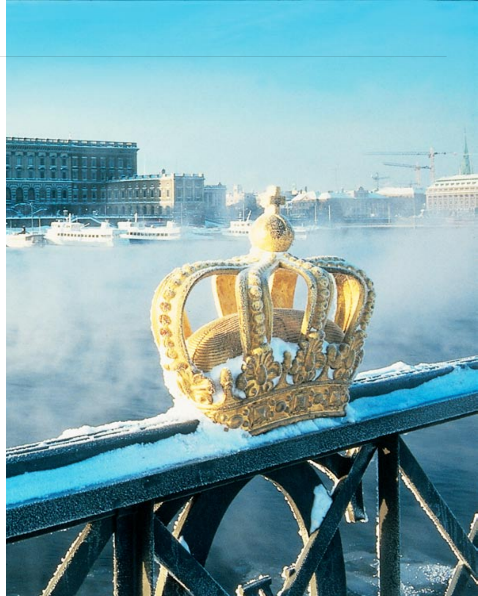
The Royal Castle of Stockholm, hidden by the winter morning fog.

Scandinavian Perspectives has a broad network within the industry. Whatever your scope of business is we can help you arrange study visits, seminars or courses in a subject of your choice. Feel free to contact us for more information.