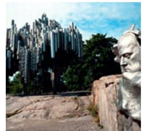
Sibelius Park was built in memory of the Finnish composer Jean Sibelius and is one of the most popular sights in Helsinki.

Helsinki has numerous good pubs and clubs for midnight ramblers, and you may want to visit the Casino. Theatres have shows in Finnish, so consider choosing opera or ballet instead at the Finnish National Opera. Music festivals are popular events, as are film festivals. Linnanmäki Amusement Park is the place to go for lovers of merry-go-round.