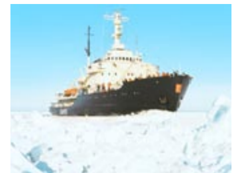
Icebreaker tours are available in Sweden and Finland.