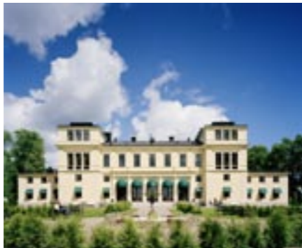
Rånäs Slott is a beautiful Manor, it was built in 1833.

Gotland is the largest island of Sweden. It is a tranquil part of the earth, a place for revitalisation, an island for inspiration. The