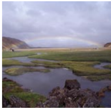
You will experience wilderness and wildlife, energy and total calm.

Iceland is a spectacular island. Large parts of the country is still taking shape, volcanic eruptions and glaciers are carving out the dramatic landscape.