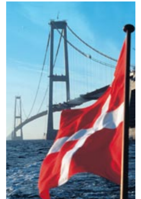
The Öresund Bridge is the connection between Denmark and the vibrant Malmö region.