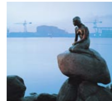
The Little Mermaid, one of Denmark's most famous statues, is beautifully situated in the harbour of Copenhagen.

There are several casinos with different kinds of games in Denmark, for instance at Radisson SAS Scandinavia Hotel in Copenhagen.