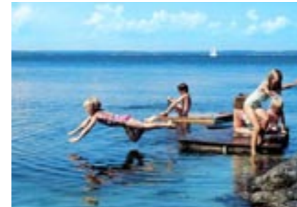
Swedes benefit from a traditional, and now constitutionally protected, "right of public access" which entitles people to hike, sail, camp and pick wild flowers, mushrooms or berries almost everywhere.

Stockholm has several harbours with ferries and cruise ships departing for Finland, the Baltic States and Poland. Many boats also make trips to the Stockholm archipelago, including famous Drottningholm Castle