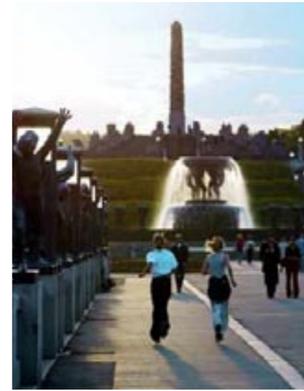
Oslo is the business and cultural centre of Norway and is considered one of the world's foremost shipping cities

Stor-Oslo Lokaltrafikk is responsible for all local transportation in the Oslo area, and for one fee only; it is possible to go by bus, boat, subway and tram. The Norwegian State Railway (NSB) also has a well-developed network. Most of the routes travel through pleasant country for tourists, offering non-stop panoramic views of beautiful, untouched natural areas.