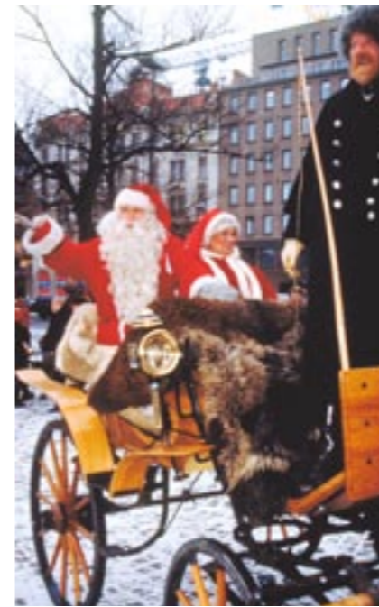
Santa and his reindeers live in Lapland in the north of Finland.