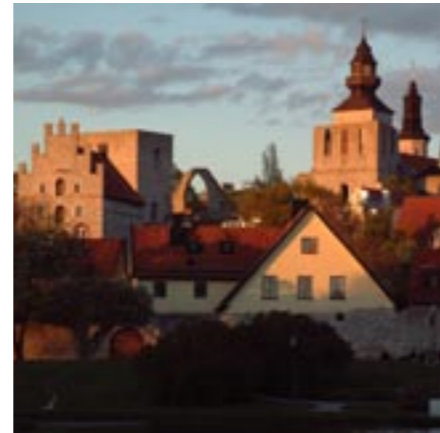
The medieval city of Visby is surrounded by a ring wall and hides narrow alleys, stepped gables and roses. Like a fairy tale!

nature is stunning and the island offers a wide range of cultural activities with roots in the Viking and Middle Ages. Gotland is beautifully situated in the Baltic Sea and is well connected to the mainland by high-speed ferry. Visby, the city of Gotland, is surrounded by a ring wall that hides roses and narrow alleys. A Congress Hall will be opened in 2007 and the island offers vast conference and meeting facilities.