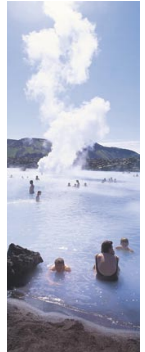
Hot springs are found all over Iceland. The water is actually boiling!

The largest holiday each year is Independence Day, on June 17th. It is a time of colorful parades, street music and dancing, outdoor theatres and general merriment. There are many other nationwide celebrations too. Sjómannadagurinn, in the first week of June, is dedicated to seafarers and has swimming contests, tugs-of-war and sea rescues. Midsummer is celebrated all over Scandinavia at the end of June. Another summer celebration is Sumardagurinn Fyrsti, a carnival on the first day of summer, in Iceland said to be the third Thursday in April.