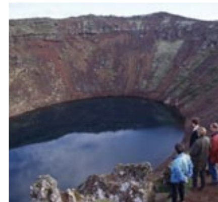
The landscape of Iceland is wild and amazing.