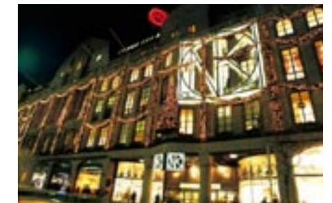
Scandinavian design in both fashion and furniture can be found at Nordiska Kompaniet.

In Stockholm alone there are 3,000 restaurants and cafés. Several Swedish chefs and confectioners have won international prizes in the past few years, with the help of regional specialties such as cloudberry, reindeer and elk.