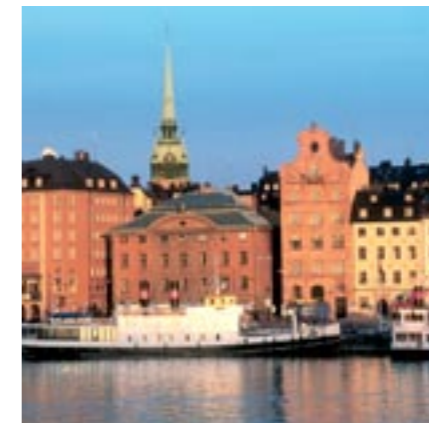
The old town of Stockholm is one of the most preserved medieval city centre.