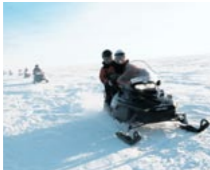
Going by snowmobile is the fastest way to get around in the winter landscape. And certainly the funniest!